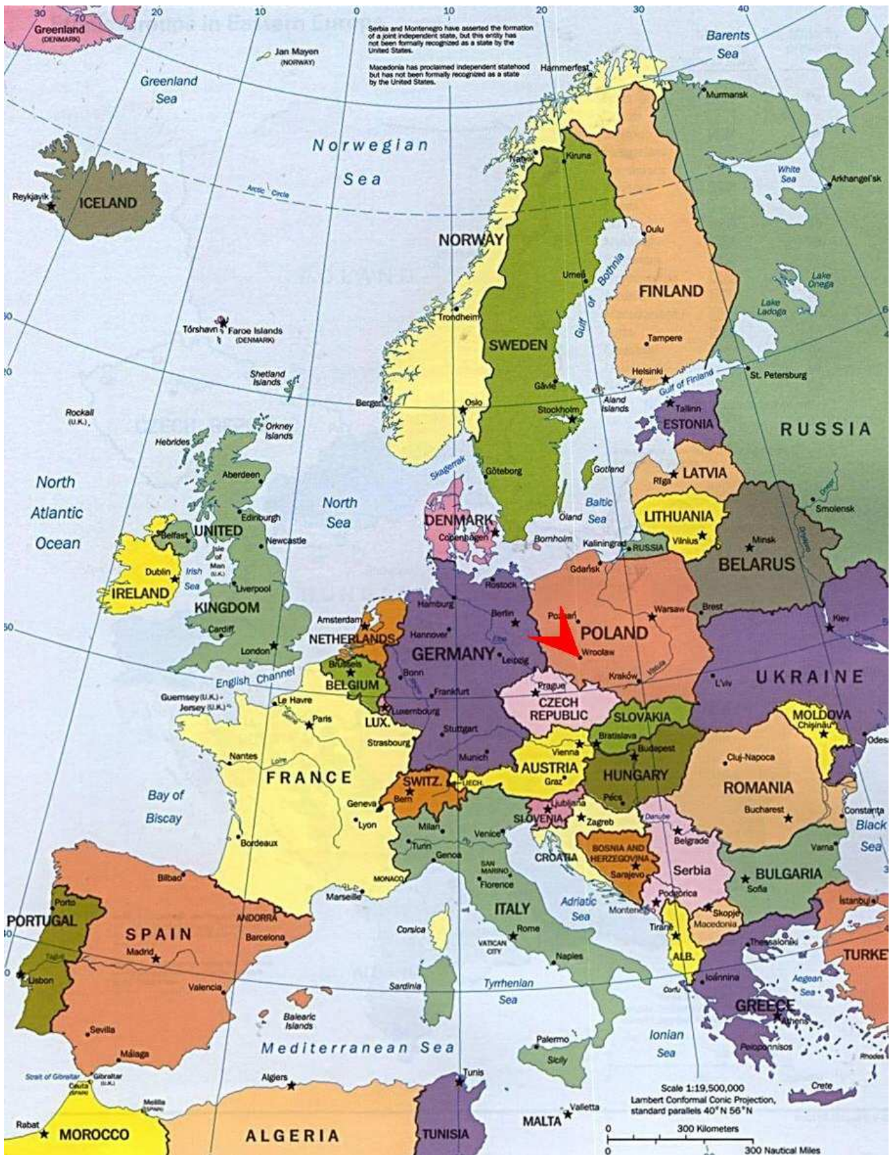
Wrocław in Poland and Europe